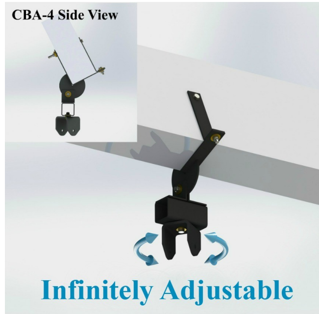
Figure 1. PY1-CBA-4 - Polar Focus PY1 Quick Disconnect Fitting with Type 4 Custom Beam Attachment Allows a loudspeaker cluster to be mounted to a rolled large wooden or glue-lam beam with pan control.

Polar Focus Ultimate Line Array Rigging. For more assistance, call our audio rigging consultants at (413) 586-4444.