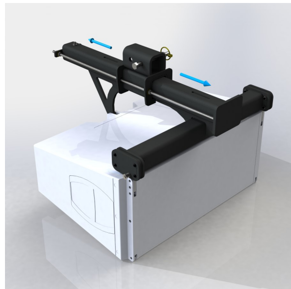
Figure 2. Polar Focus Stork Frame for d&b V-series Loudspeakers

Allows the array to have easily adjustable pan and tilt under full load.