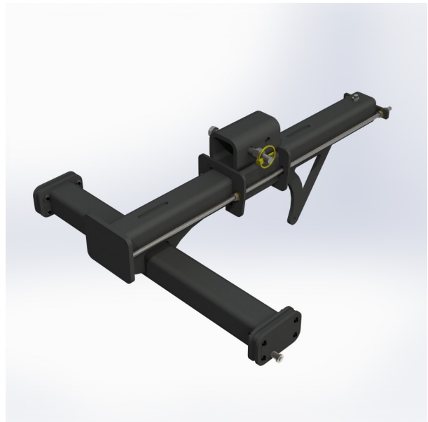
Figure 1. Polar Focus Stork Frame for d&b V-series Loudspeakers

Call our audio rigging consultants for more information at (413) 586-4444.